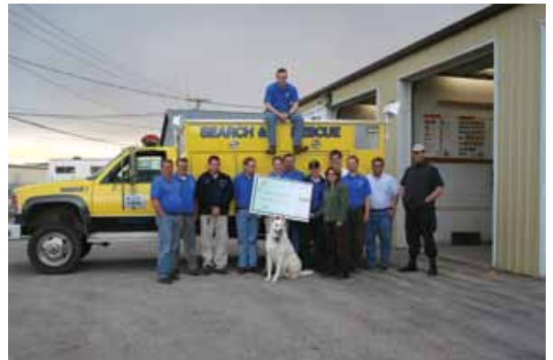
Pennington County Search & Rescue received $2000.00 to help with the replacement of the high-angle rescue equipment.