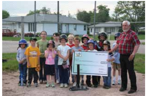
New Underwood Youth Organization received $250.00 for the upkeep of the Baseball Fields.

Operation Round-Up will be accepting applications for funding; the deadline to apply is February 28, 2011. Anyone interested in applying for funds, please stop by to pick up an application at the Wall or Rapid Valley Office, call – Rapid City at 393-1500 or Wall 279-2135 or go online to westriver.com. To sign up to donate to Operation Round-up fill out the form below and return with your payment.